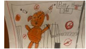
LIL' PETEY IS WANTED FOR POTTY HUMOR