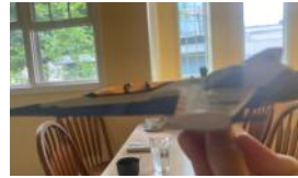
BUZZ LIGHTYEAR'S SHIP FLYING THROUGH KITCHEN BATTLING ENEMY SHIPS