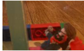
PIRATE IS GOING TO BE A BUCCANEER AGAIN