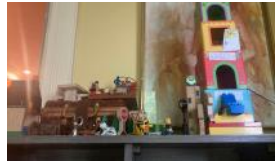
BINGO WILL BE BUSIER WITH NEWS, SO GO TO BINGO!